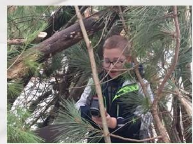
We used a thermal imager to look for cooler spots in our forts