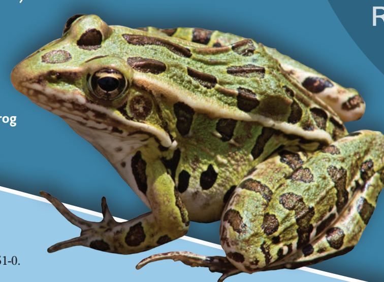
Northern leopard frog