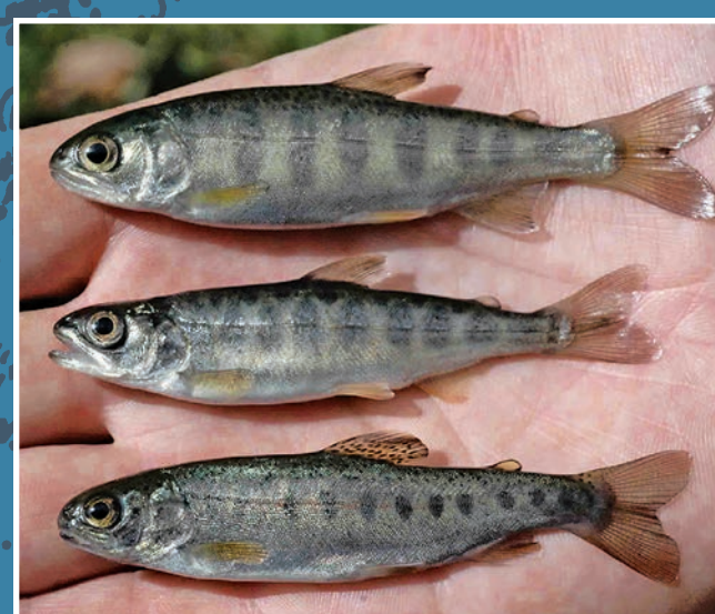
Biologists discovered (from top) coho, chinook and steelhead fry naturally hatch in Willow Creek, a Sheboygan River cold-water tributary.