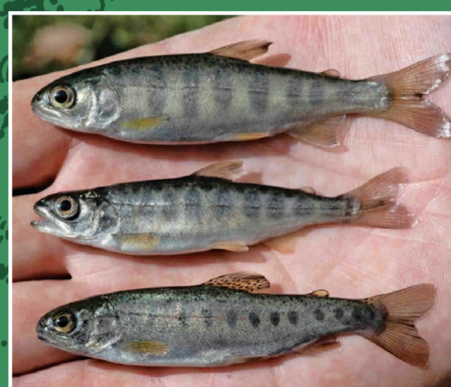
Biologists discovered (from top) coho, chinook and steelhead fry naturally hatch in Willow Creek, a Sheboygan River cold-water tributary.