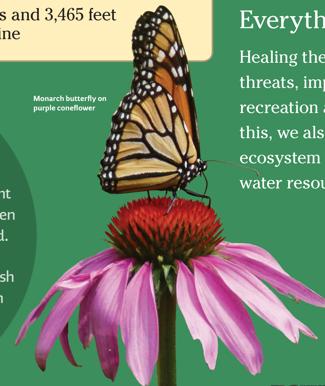
Monarch butterfly on purple coneflower

Follow advisories to avoid or limit eating fish and waterfowl caught in the Sheboygan River and Harbor until samples show that PCB levels in the food chain have dropped.