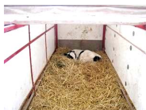
Nesting Score 3 Legs generally not visible when laying