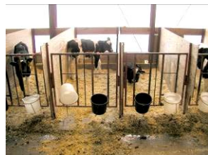
Nesting Score 1 Legs entirely visible