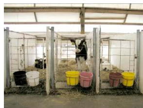
Nesting Score 2 Legs partially visible when laying