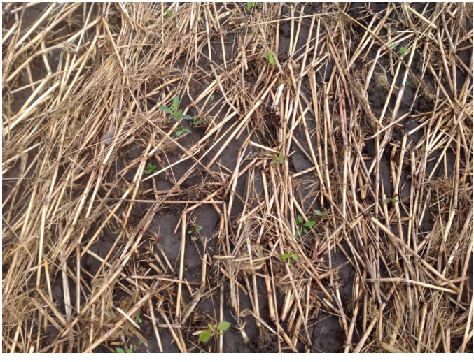
Sorghum sudangrass residue did not provide adequate weed control for no-till planting. Equinox Community Farm 5/12/17.

Visual inspection of the plots just before scheduled tomato planting in May 2017 showed that the remaining cover crop residue was covering only 20% to 60% of the ground leaving a high percentage of the soil exposed. Weed population counts at the same time averaged between 8 and 37 weeds per square foot, depending on the farm. Finally the cover crop biomass had dropped dramatically on all the farms (Figure 1). The warm February 2017 temperatures and the wet spring likely contributed to accelerated decomposition. Clearly the remaining residue would not be enough to suppress weeds during the tomato cropping season.