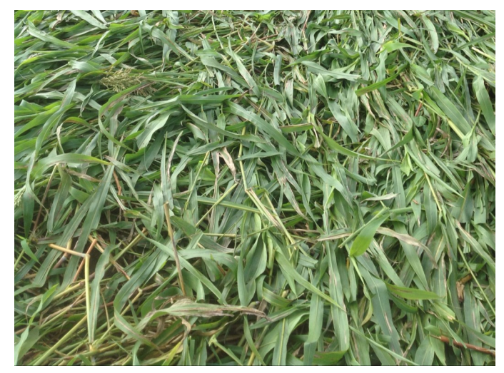
Sorghum sudangrass mulch mat, post rolling. Blue Moon Community Farm 10/4/16

A thick mulch layer is key to suppressing weeds in the cash crop production season. The goal was to produce at least 10,000 lbs. of cover crop dry matter per acre to allow for some decomposition over winter and to have an adequate mulch layer in place for the following cash crop season. Just before rolling, the average dry matter per acre across all farms and treatments was 13,165 lbs. All plots on all farms produced more than 10,000 lbs. dry matter per acre with the exception of two plots producing just 7,577 lbs. and 9,088 lbs. The high end of the range was 19,693 lbs dry matter per acre.