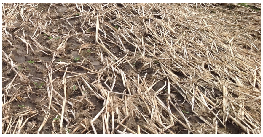
Sorghum sudangrass residue did not leave an even mat where fall winds caused the cover crop to lodge before rolling. Crossroads Community Farm 5/11/17.

Based on these observations and numbers, the farmers and researchers decided to abandon the original project prior to tomato planting. Instead the project pivoted to a comparison of mulches used with no-till planted tomatoes. (See "Plastic, Fabric, and Marsh Hay Mulch with No-Till Organic Tomatoes")