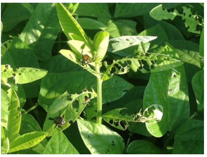
Japanese Beetles on sunn hemp 8/3/16.