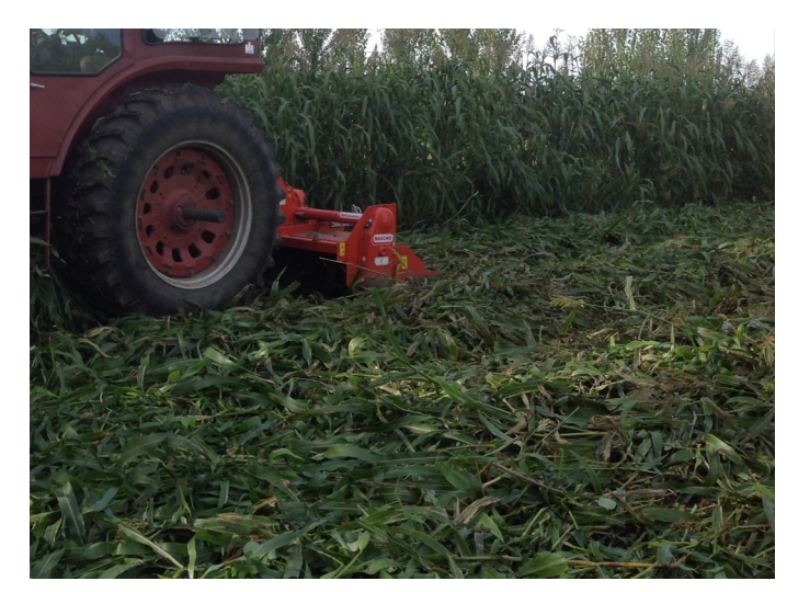
Rolling sorghum sudangrass with a disengaged rotovator. Equinox Community Farm 10/14/16.