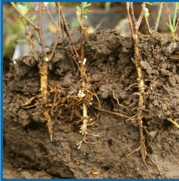
Alfalfa plants with Aphanomyces seedling blight/root rot have reduced numbers of small, fine roots.

How can I save plants with Aphanomyces root rot? There is no way to save an alfalfa crop once ARR has occurred. Fungicide seed treatments may provide short-term protection of alfalfa seedlings. However, foliar fungicides do not provide any ARR control.