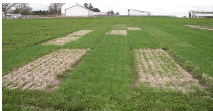
Winterhardy vs winterkilled orchardgrass varieties