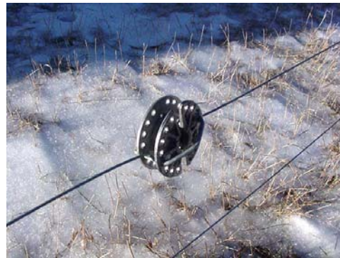
Figure 12 Daisy strainer

• Daisy strainer: The daisy strainer is probably the most popular inline strainer for a couple of reasons. The first is because it is less expensive than the ratchet style strainers, and the second reason is it can be put on the wire without cutting. The strainer is simply put on the wire and twisted until the desired tension is reached (Figure 12). The disadvantage is it is a bit more difficult to adjust the tension because of the way the way it attached to the fence.