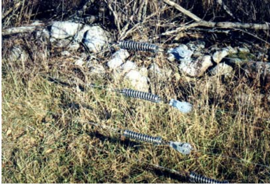
Figure 10 In-line strainer and spring

is a short (less than 440 feet) run of fence where there isn't a great deal of wire to absorb the shock of something either striking the fence or below freezing temperatures that causes the metal to contract. The spring arrangements usually have marks on them to denote the force exerted on the spring.