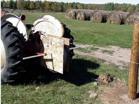
Figure 8 Homemade fence reel