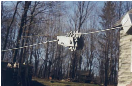
Figure 11 In-line strainer

• Ratchet inline strainer by itself: When high-tensile wires are being stretched for long (greater than 440 feet) runs the compression springs aren't quite as important. Just inserting an inline strainer will be adequate to keep the fence tight and the wire has enough spring in it to absorb shocks without putting all the pressure on the posts. Figure 11 shows one type of inline strainer.