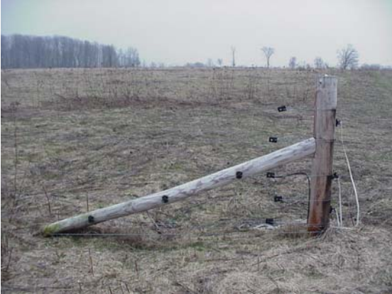
Figure 5 Plastic insulators

Fiberglass insulators: Figure 4.6 shows a fiberglass rod that has a couple of holes drilled in it and sleeves installed to help keep the wire from splitting it out. Although this is a small diameter rod with a 14.5 gauge high-tensile wire, a larger rod can be used for more applications that might be under more stress. The drawback of these types of insulators is the fiberglass will break down over time and the design has the wires away from each other, not against each other as in the donut type insulators.