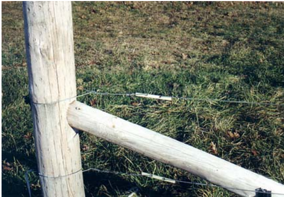
Figure 1 Knots

fencing. If done properly the knot actually tighten up and become more secure as force is applied to the fence. But like anything else high-tensile wire fence knot tying does take some practice to make sure its done properly and if you don't do it all the time you'll generally have to relearn how to do it the next time you build fence. One of its big advantages is it doesn't require extra tools, but there are a couple of disadvantages. It is tough to tie knots with wire testing over 170,000 psi, and if the wire is kinked in the knot tying process it can be easier to break when a force is applied to it.