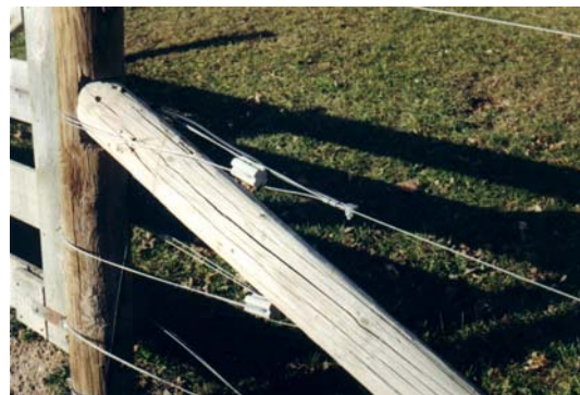
Figure 4 Bullnose insulator

Grey porcelain, bull nose insulator: Figure 4 shows an insulator designed just for these applications. These insulators are engineered to take the pressure of high-tensile fence.