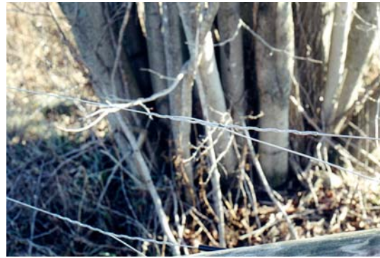
Figure 9 Twistlink

Now that the fence is stretched it time to either hook it up to the posts, either with the insulator assembly or with the wrap around insulators. Regardless of the insulators used there are three common ways of fastening the wire. The first is by tying the wire on with a fencing knot. . Another common practice is to use the crimping sleeves. Not as common but just as effective is the use of something called a twistlink. The twistlink shown in Figure 9 is a product of the utilities industry and is very easy to work with. Once it is wrapped onto the wire it actually gets tighter as the fence is tightened. One of its great advantages is it can be taken apart easily if the fence ever needs to be repaired. Its biggest disadvantage is the cost compared to tying knots or crimping sleeves.