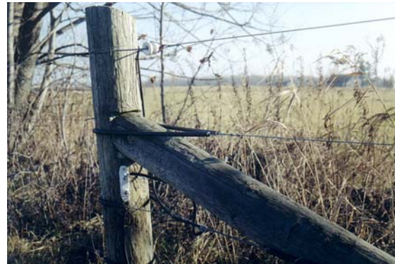
Figure 2 Wrap around insulator

wrap-around insulators is they cut a whole step out of the process by eliminating building the insulator assembly previously described. The line wire is hooked right to the post. The disadvantage is the long-term reliability. Over time some insulators will fail and if a wrap-around insulator fails it is difficult to see. It is obvious when a donut type insulator has broken.