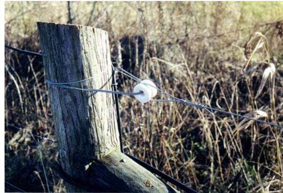
Figure 3 Donut insulator

White porcelain donut insulator: Figure 3 shows a porcelain donut style insulator that has been used in electric fencing for decades. It is a very good insulator, easily available and cheap. The problem with it is its strength. These weren't intended to be used with high tensile wire systems but if installed properly will hold up pretty well. To help distribute the force exerted by the wire, notice in the picture how the fence wire is wrapped around the insulator one full turn before it is tied off. This helps distribute the force around the entire insulator.