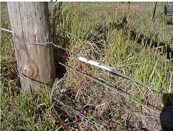
Figure 6 Fiberglass insulator

Fiberglass insulators: Figure 4.6 shows a fiberglass rod that has a couple of holes drilled in it and sleeves installed to help keep the wire from splitting it out. Although this is a small diameter rod with a 14.5 gauge high-tensile wire, a larger rod can be used for more applications that might be under more stress. The drawback of these types of insulators is the fiberglass will break down over time and the design has the wires away from each other, not against each other as in the donut type insulators.