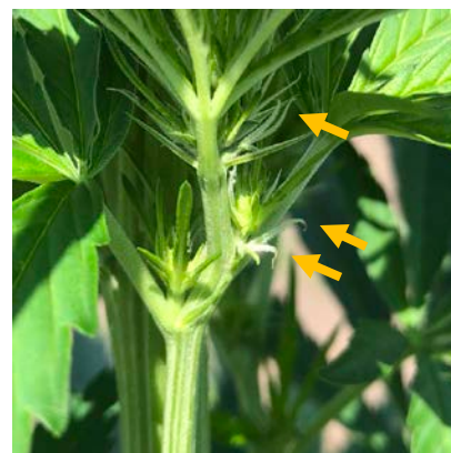
Figure 1. Flower initiation with yellow arrows pointing at the extruding stigma.

Plant height was measured from the base of the plant to the tip of the tallest inflorescence. Plants were measured when growth stopped at approximately week 5 of flowering. The data was collected in cm and is reported in inches using the average of 18 plants for seedling and clonal cultivars and 10 plants for day-neutral cultivars.