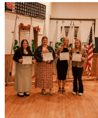
Kewaunee County 4-H Graduates