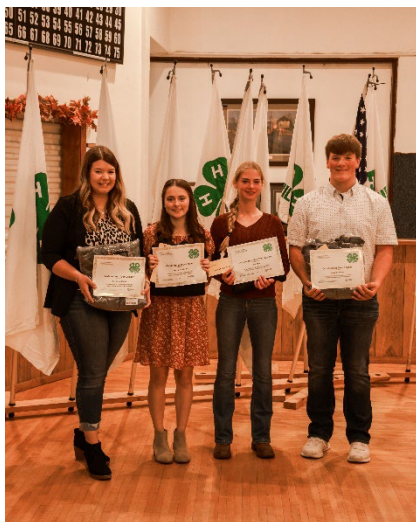
Outstanding Teen Leaders