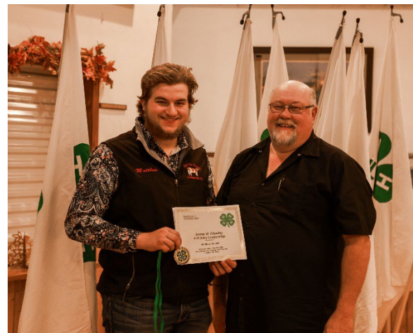
Crowley Dairy Award Winner