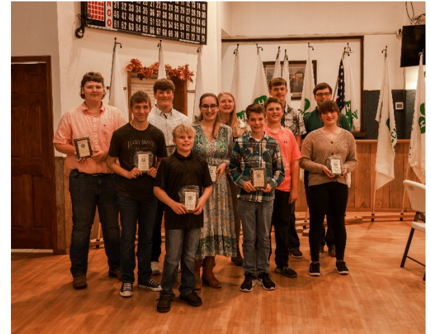
2024 Outstanding 4-H Club and Project Members