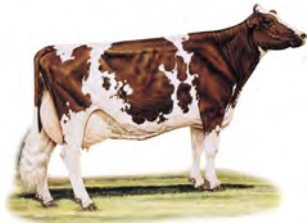
Red & White