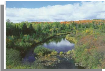
The Kakagon-Bad River Sloughs are a pristine Lake Superior estuary located on the Bad River Reservation, near Ashland, WI.