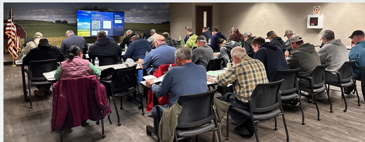
St. Croix County Training Session

Training Sessions cover a large portion the Educational Materials . These are review sessions before the certification exam. DATCP-provided exams are given during the final 2 hours of the Commercial Training Session. County Extension personnel provide the Private Applicator certification exam.