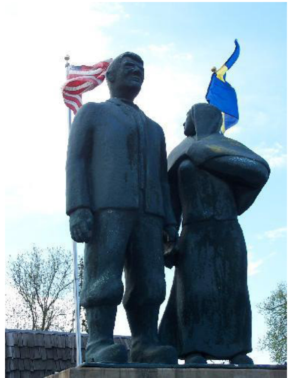
Statue of Karl and Kristina Oskar.

Lindstrom is made up of volunteers and community members who love their neighborhood and want to contribute to its success. A culture of service is evident in Lindstrom, and community leaders believe the key to ensuring this type of culture is to maintain activities on a volunteer basis. While there are pros and cons to this approach, volunteers in Lindstrom invest their time and