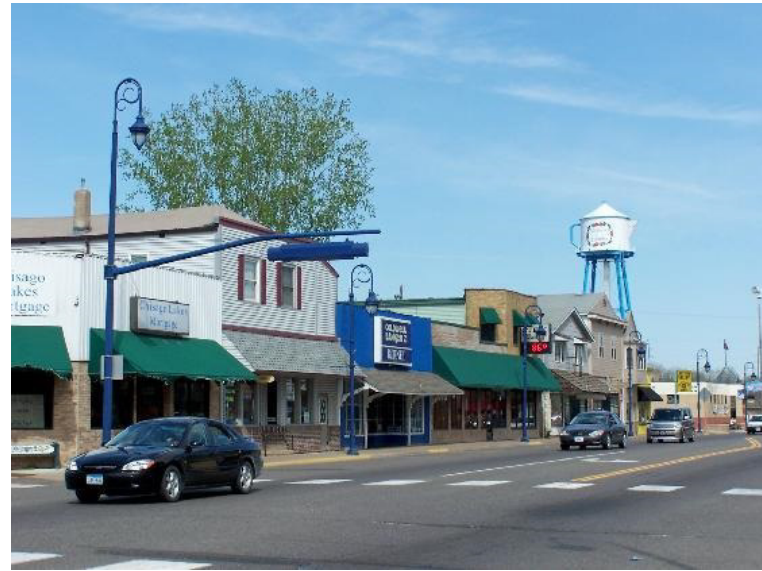
Downtown Lindstrom.