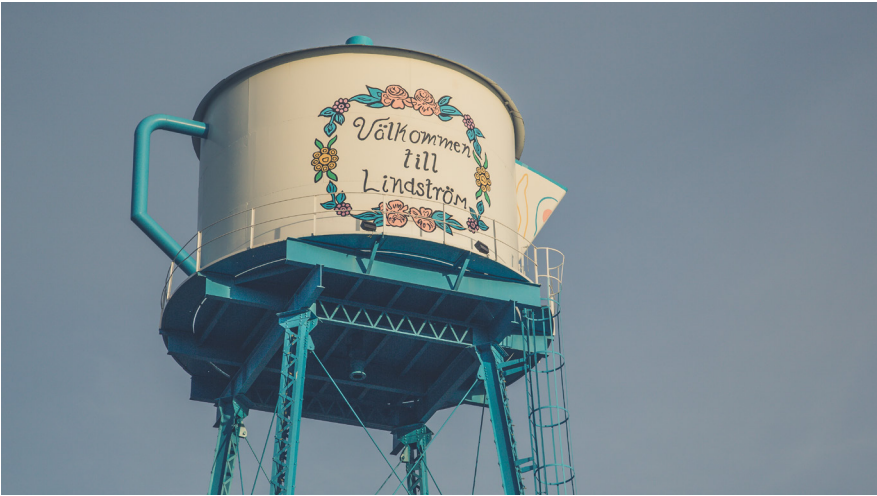
Coffee Pot Water Tower.

community be more competitive in home sales, as it is becoming increasingly important to access the Internet for school, work, and entertainment.