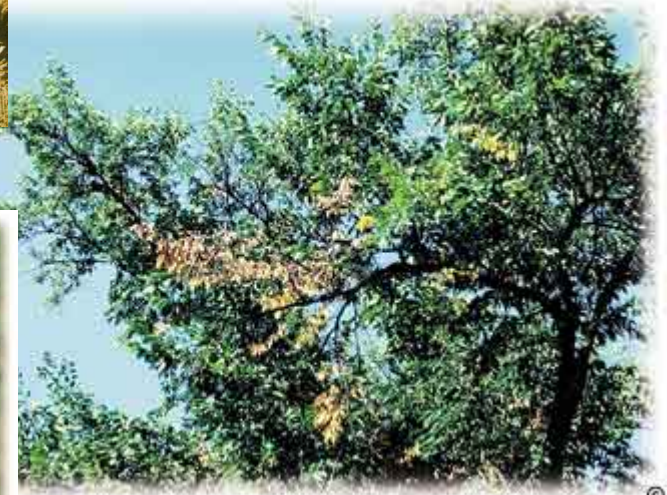
"Flagging" symptom of infection by elm bark beetle

Credits: Photos from: www.midwestlandscapeplants.org and various other .edu websites unless noted. Text from: "Manual of Woody Landscape Plants" by Michael Dirr; "Tree Identification Characteristics (abridged)" from the University of Illinois Extension; www.midwestlandscapeplants.org ; and misc. other sources. This publication may not be sold except to cover the cost of reproduction when used as part of an educational program of the University of Wisconsin-Extension.