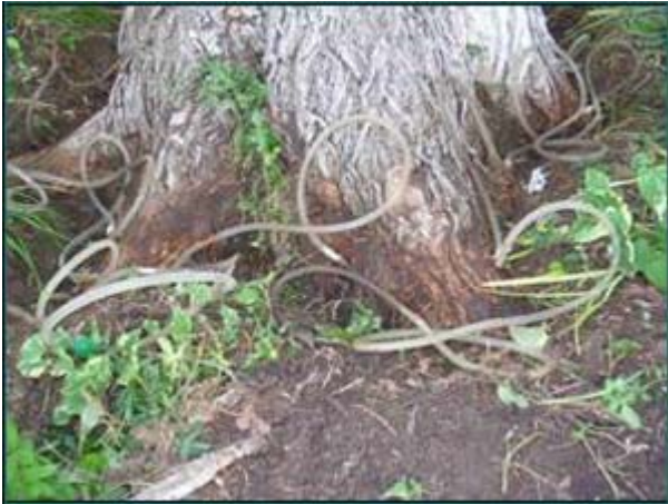
Root flare injections of fungicide