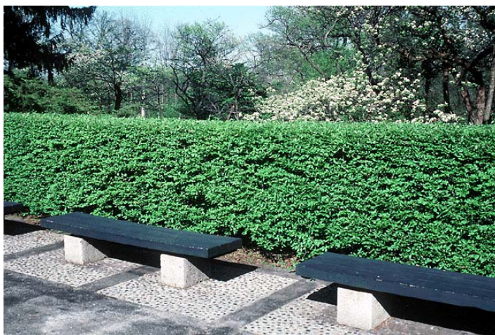
Sheared into a formal hedge