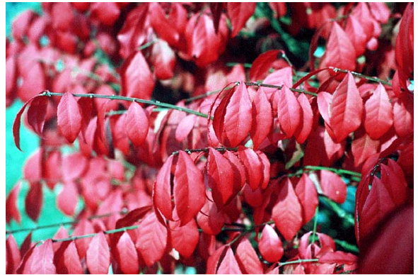
Dwarf Burning Bush