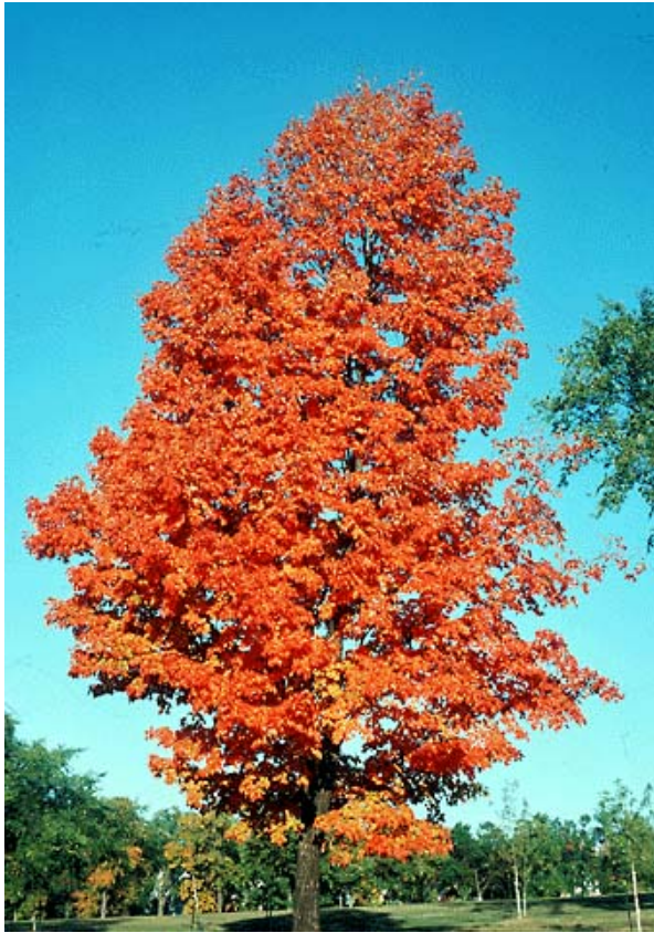
Fall color o