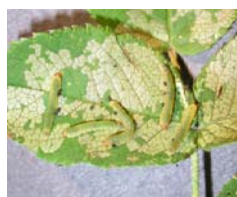
Rose slug sawfly

Climbers - have long arching canes and need support; can be hybrid tea, floribunda, grandiflora, lg. flowered climbers, minis.