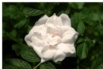
'Blanc Double de Coubert'