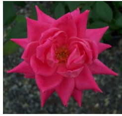
Pink Double KO