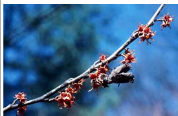
Vernal W. - H. vernalis

Leaves: simple, broadly oval, with roughly indented margins that are quite variable, deep veins that run out to the margins.