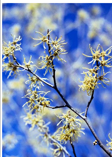
Common W. - H. virginiana