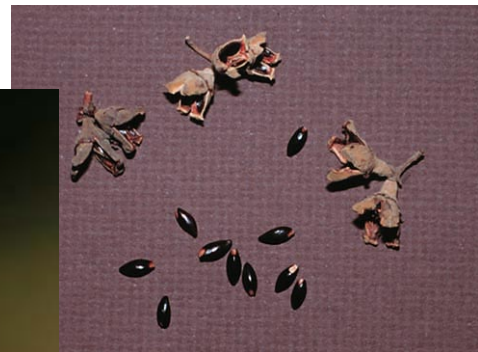
Fruit capsules and seeds