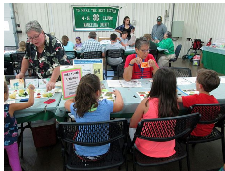
Waukesha County Fair