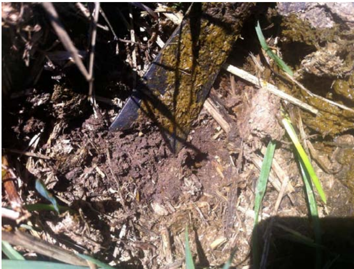
Photo 1. A dung beetle tunnel located beneath a dung pat that has been removed.

Pasture managers are interested in dung beetles because these insects serve beneficial roles in the microenvironment of a dung pat that positively impact the larger pasture ecosystem. Dung beetles may play a significant role in controlling horn fly populations. Horn flies also use dung to reproduce and the adults feed on the blood of cattle and other grazing livestock. Their pesky feeding behavior can greatly reduce cattle weight gains, reduce vitality, and may cause animal injuries as the cattle try to stop their annoying blood-sucking. An Australian study reported that the introduction of 23 dung beetle species in a particular area resulted in a 90% reduction of bush fly populations (a species similar to horn flies). By maneuvering around the dung pat and manipulating dung into brood balls, dung beetles can physically damage the eggs of horn flies. Evidence also exists that Sphaeridium scarabaeoides larvae may feed on fly larvae in the dung pat.