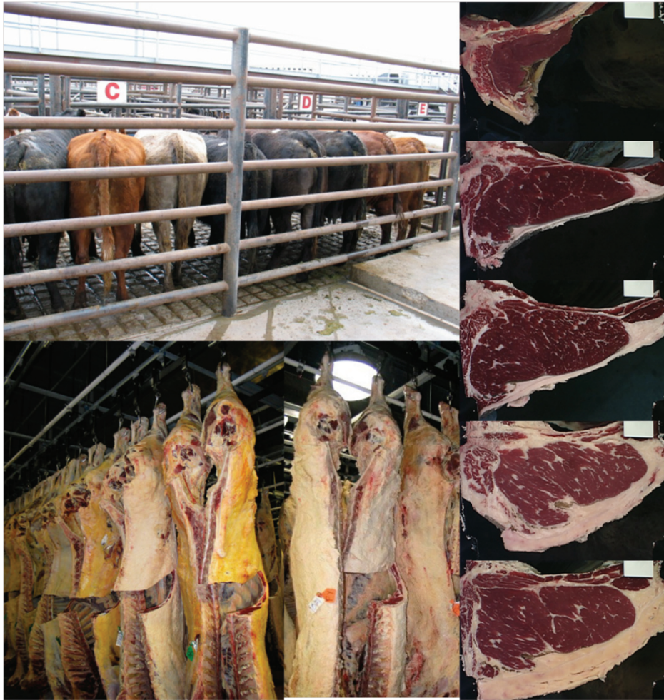
Figure 2. Cow, carcass, and ribeye images illustrating the amount of variation in live animal and carcass composition that exists in the market cow industry.

The cull-cow market comprises a significant portion of United States (U.S.) beef production. In fact, culled market cows, cows culled from cow-calf and seedstock producers as well as dairy operations, have consistently accounted for 17 to 19% of all cattle harvested in the U.S. each year. This equates to just over six million head and nearly 80,000 metric tons of boneless beef produced annually in over 55 major facilities. Most consumers believe that all cow beef ends up as ground beef and ultimately serves as the source for hamburgers in fast food restaurants. While the majority of boneless beef products produced from market cows is ultimately destined to be ground beef, nearly all facilities that are processing cows are producing whole-muscle cuts. These cuts include round cuts that serve as pure lean sources to upgrade conventionally produced ground beef, as well as rib, loin, round and chuck cuts that are merchandised as steak and roast items for foodservice applications. The most recent National Market Cow and Bull Audit (NCBA, 2007) indicated that 100% of audited facilities were producing rib and loin cuts and showed that