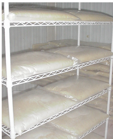
Sheep milk in frozen bags

For those interested in learning more, an interactive economic evaluation spreadsheet is available on the Wisconsin Sheep Dairy Cooperative website: www.sheepmilk.biz .