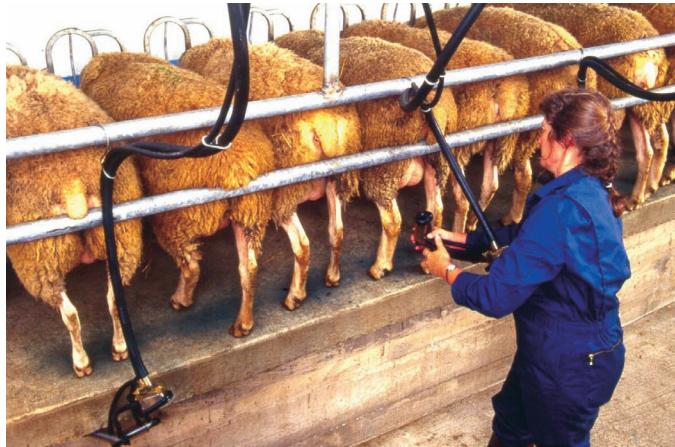
An elevated milking platform

At a minimum, the milking equipment in the parlor will include a vacuum pump and vacuum line, milking claws, and a milking bucket. Milking time is reduced with more milking claws and buckets. Buckets are used to carry milk from the parlor to the milk room. Installing a milk pipeline, which transports milk from the parlor to the bulk tank, reduces labor but increases capital and maintenance costs. In the milk room, the milk is deposited into a bulk tank for cooling. After the milk is cooled, it can be transported to the processing plant or frozen on site.