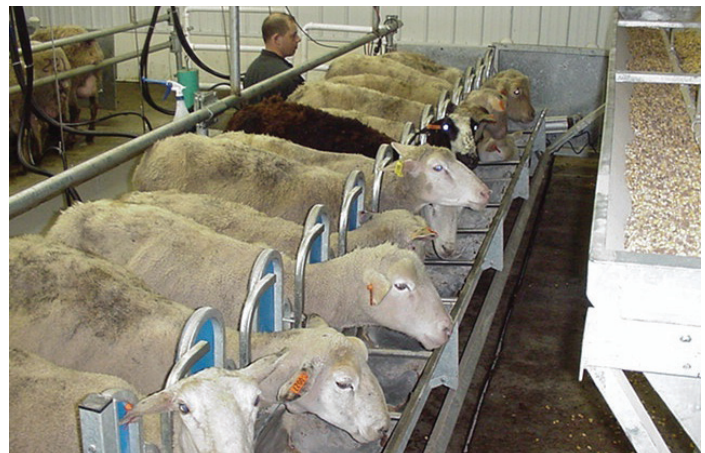
A pit parlor with movable stanchions