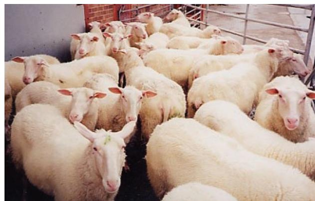
East Friesian dairy ewes

Some non-dairy domestic breeds such as Dorset and Polypay are reasonable milk producers, but the production of these breeds is far below that of specialized dairy breeds.