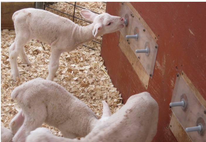
A lamb nursing on milk replacer

Adequate clean water is essential, as milk is 88% water. Lactating ewes have the highest requirement for water of any class of sheep: approximately 3 gallons per ewe per day. A mineral mix with salt formulated specifically for sheep must be offered free choice at all times. It should have no added copper (toxic to sheep) and added selenium (deficient in the Great Lakes region).