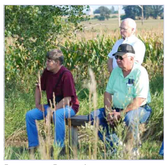
Touring a new Town park

A peer learning group is a group of individuals with similar responsibilities who have a desire to learn from each other.