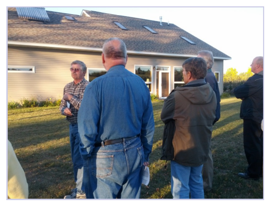
Visiting a local alternative energy farm.