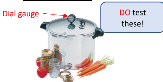
Dial gauge canner